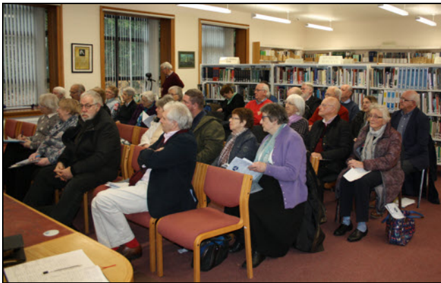
Delegates at the AGM

The AGM was held in the Centre for Migration Studies at the Ulster American Folk Park, in Omagh on Saturday 16 November 2019.