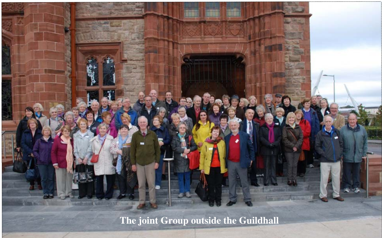
The joint Group outside the Guildhall

Both groups pronounced the trip to have been an outstanding success.