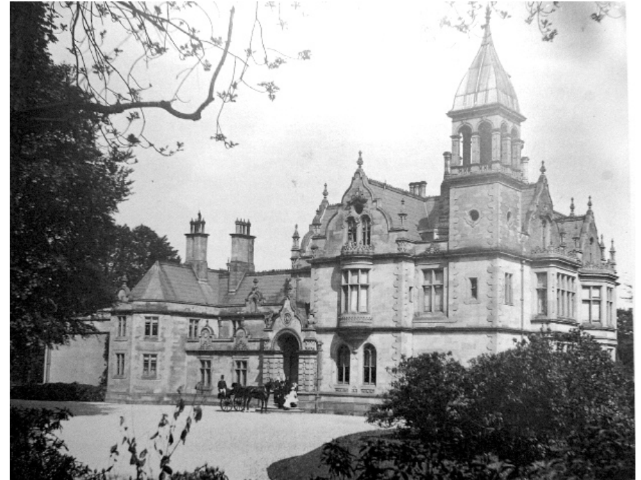
STRANMILLIS HOUSE AROUND 1880

Stranmillis University College grounds embrace the core of the Stranmillis Conservation Area and contain an estate of woodland, lake and historic gardens which has changed little in almost 500 years.